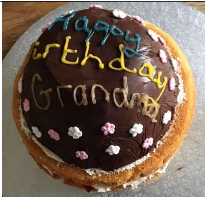
Miss Devlin's Chocolate crunch