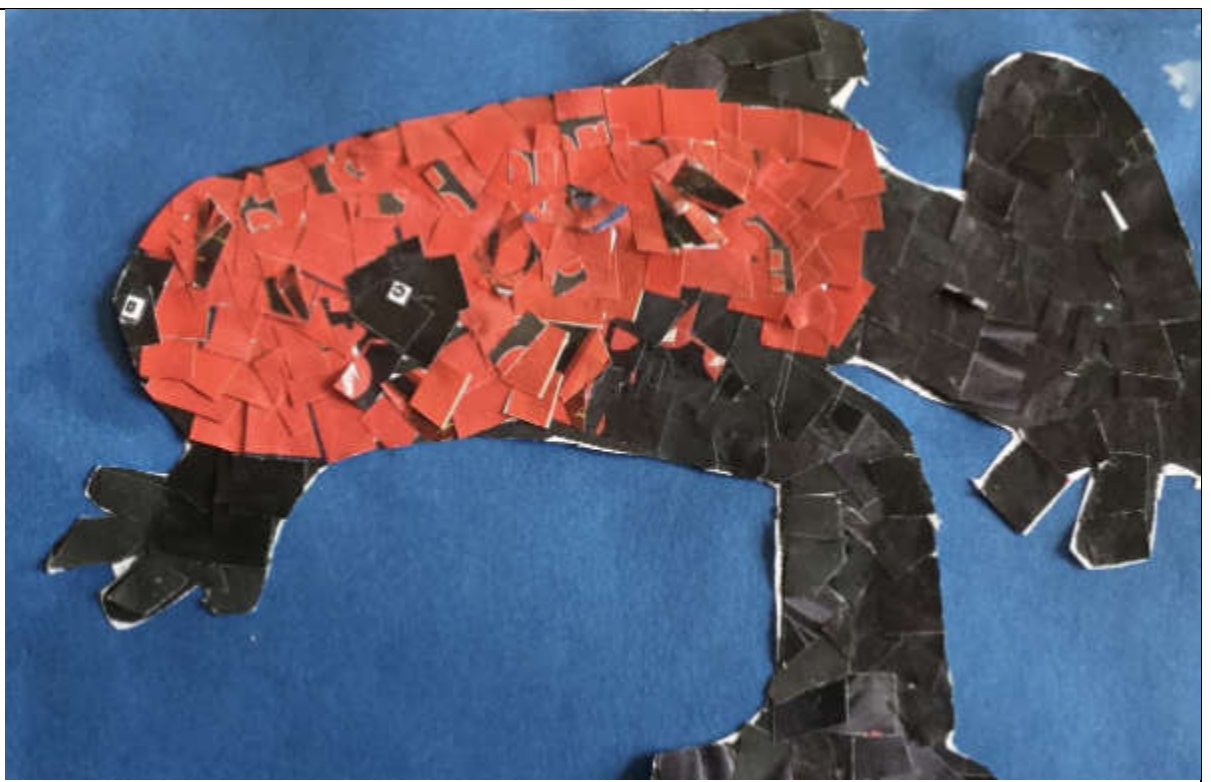
Captain Tom Moore birthday cards